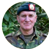
Colonel Frank Overdiek, Commandant, Land Training Centre, Royal Dutch Army